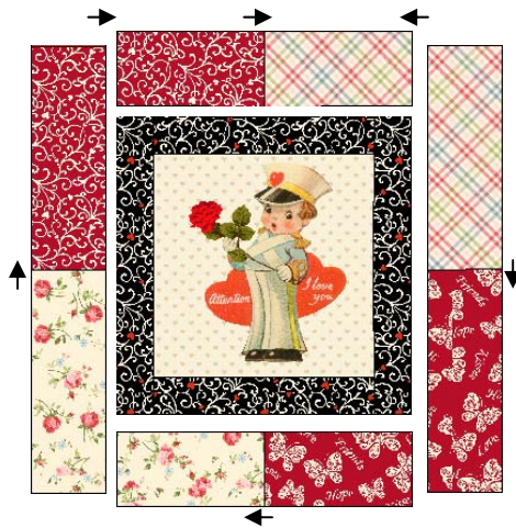
Colorway #2 Block Assembly Diagram

Note: Refer to the quilt image for layout of blocks and borders. There are five rows of