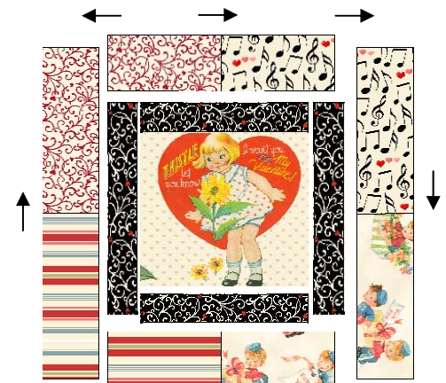
Colorway #1 Block Assembly Diagram

5. Repeat step four for the musical notes 5" wide strip and the small multi print 5" wide strip. Sew segments to the right side of block.